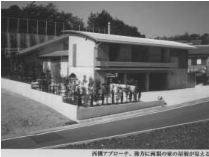
Hisako Suzuki, Two Generation House

and their mother. The long but narrow lot defines the shape of the house. The mother has a separate entrance with traditional tatami bedroom and bath on the ground floor, with kitchen, dining and living areas on the second floor. The daughters have the larger half of the house which includes a garage and an attic. Wood floors and ceilings contrast with white walls and sliding partitions. Skylights provide additional light to the upper floor. The house is modular – based on the tatami size.