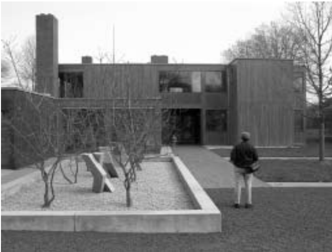
Korman House and Garden

Virginia Polytechnic Institute and State University Fall 2006 No. 18